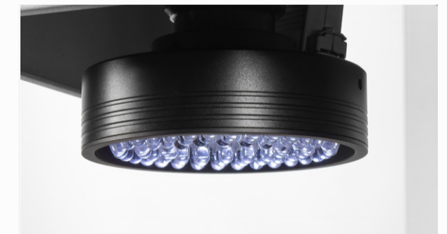
PRODUCT DETAILS ■

Hard-anodized workbench with anti-scratch and anti-oxidation function