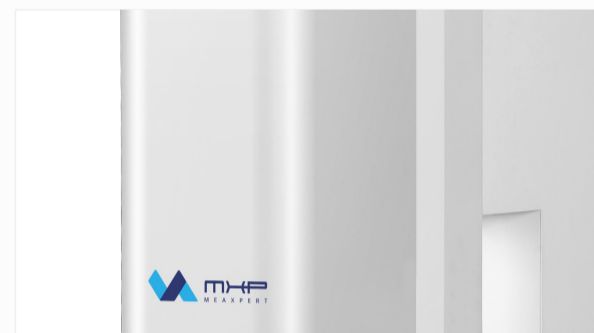
PRODUCT DETAILS ■