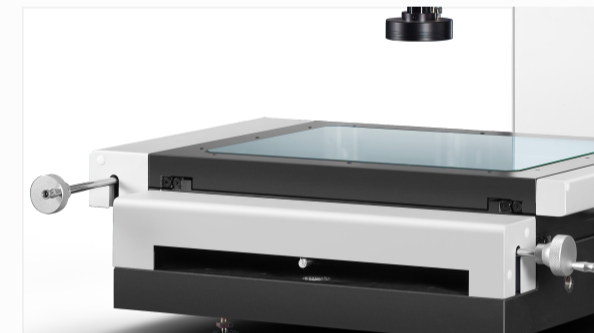
PRODUCT DETAILS ■

Square steel column, with higher bearing capacity, smaller deformation, and safer transportation.